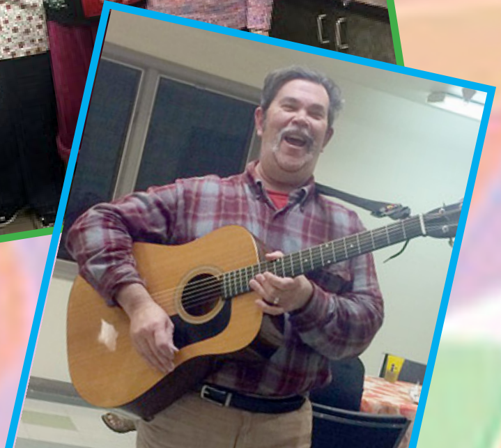
ST. LUKE'S HELPING HANDS AT SAFE HAVEN'S 2016 CHRISTMAS CELEBRATION