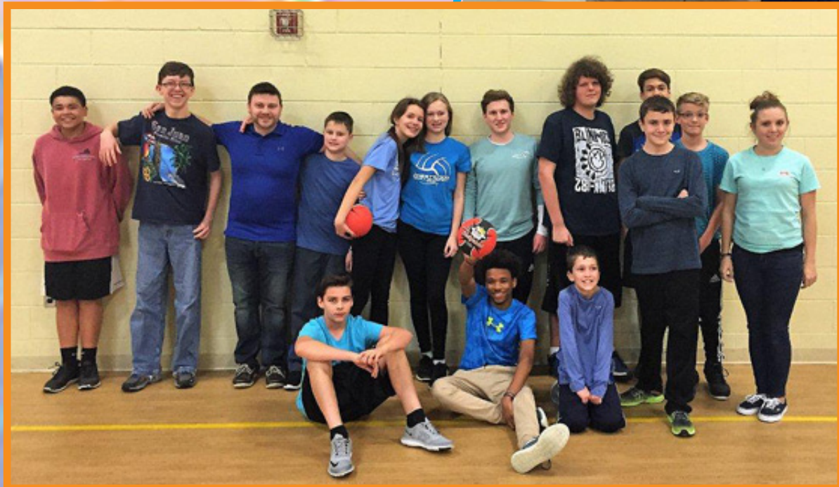
Dodgeball Tournament - The Avengers - 2017