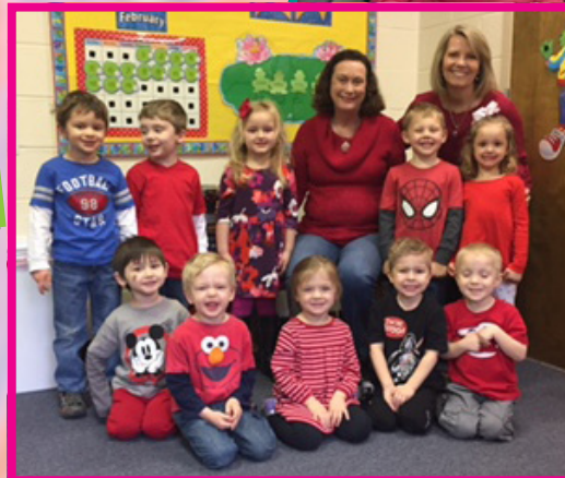
Our Preschool and church staff celebrated Heart Day by wearing red.