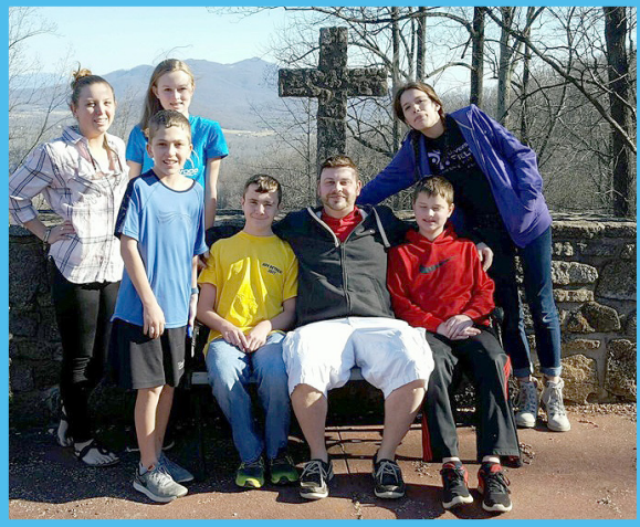
Our Youth enjoyed a Spiritual Retreat at Eagle Eyrie