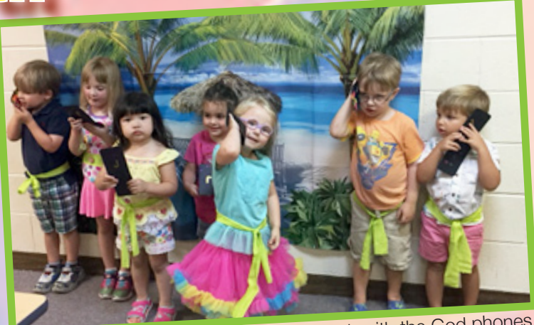
This is the Iguana Crew from Bible School, with the God phones they made in art. One of them said, "I am face-timing Jesus!" What a fun way to pray!