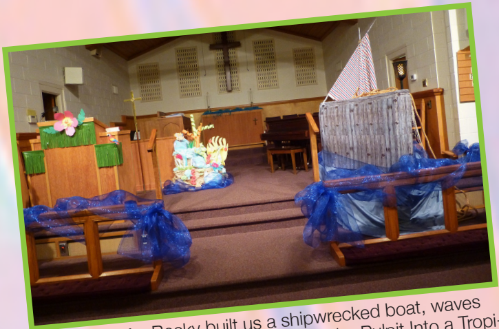
REALLY?! Ms. Becky built us a shipwrecked boat, waves included, in the Sanctuary and turned the Pulpit Into a Tropical Paradise WOW!