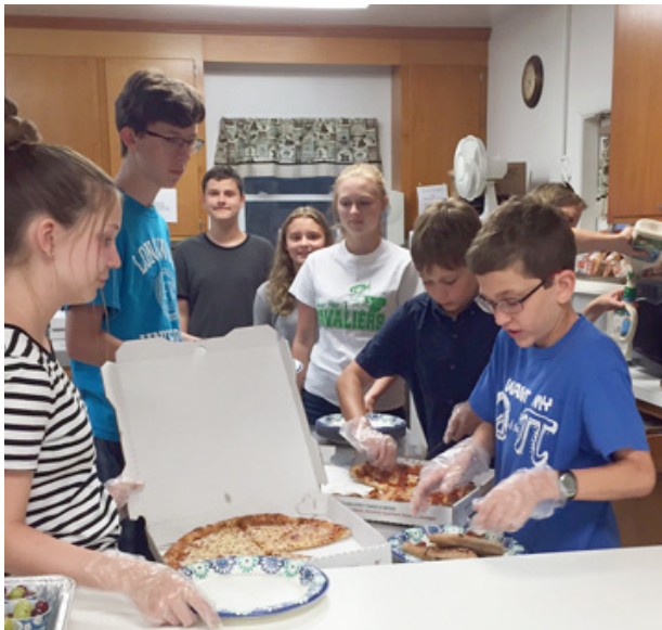
Youth preparing to serve CARITAS quests

Our towel washers, our over-night-ers, our clean-up crews, our early evening coordinators, our worship leaders, our laundry leaders, and our shower chauffeurs. WOW! Help WANTED, and help FOUND! Almost the entire congregation responded, not to answer an ad in the paper, but rather to offer an invitation to these women, into the Community of the Faithful and the Kingdom of God.