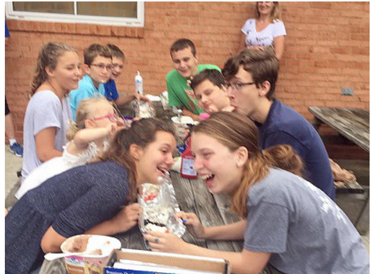
OUR YOUTH KICK OFF THE NEW SCHOOL YEAR IN SEPTEMBER WITH THE TRADITIONAL 8 FT. LONG GUTTER SUNDAE!