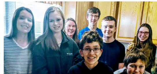
Pizza Party at Hearhavens