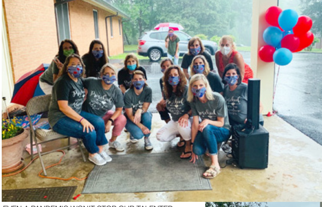
EVEN A PANDEMIC WON'T STOP OUR TALENTED PRESCHOOL STAFF!

PRESCHOOL GRADUATION 2020! "LIFE ISN'T ABOUT WAITING FOR THE STORM TO PASS, IT'S ABOUT LEARNING TO DANCE IN THE RAIN!"