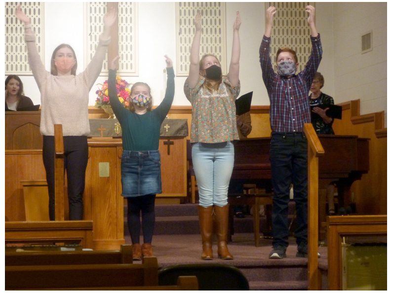
PRAISING HIS NAME - ST. LUKE'S YOUTH SUNDAY, OCTOBER 17, 2021