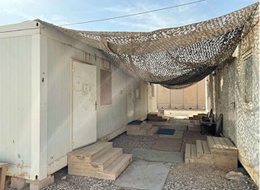
Larry"s new home, called CHUs (Containerized Housing Units).