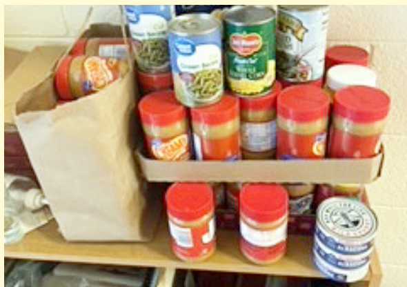
Peanut butter and canned food St. Luke's collected for Walmsley

We are asking for canned goods or dry goods that you typically see on your Thanksgiving or Christmas table. Examples from the Belmont Pantry food list include - canned fruits or vegetables, instant potatoes, rice (boxed and instant). Please donate what you can. No glass containers, please. Thank you!