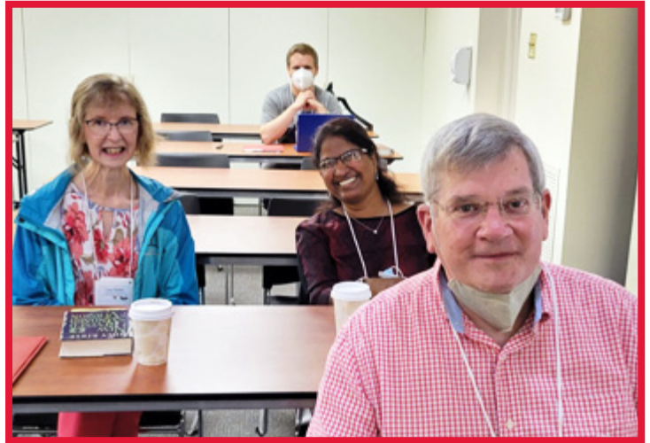
BEFORE CLASS BEGINS ON A STUDY OF THE PSALMS

I share pictures from the Academy with you in this newsletter, and I encourage you, as laity, to consider attending an Academy yourself, if you feel called to pursue spiritual renewal for your soul. Again, I thank you for giving me the opportunity to attend!