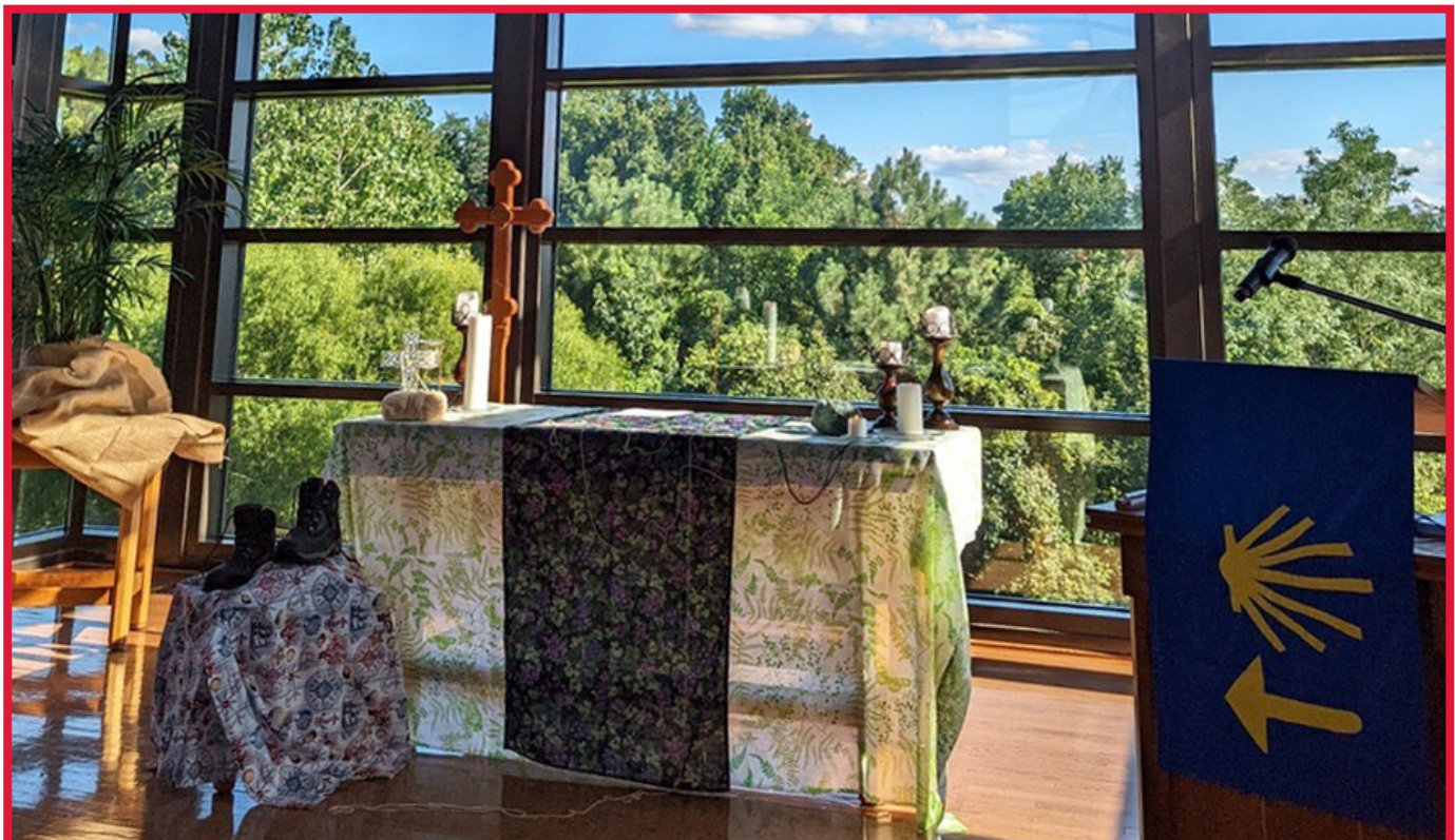
THE CHAPEL AT ROSLYN RETREAT CENTER.