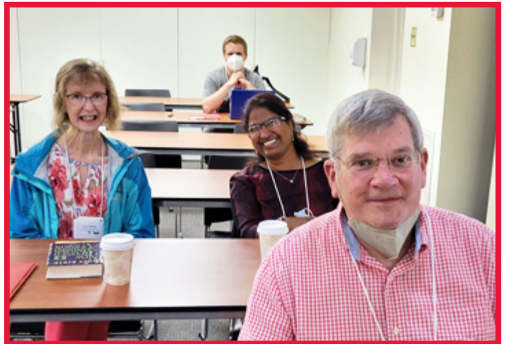
BEFORE CLASS BEGINS ON A STUDY OF THE PSALMS

I share pictures from the Academy with you in this newsletter, and I encourage you, as laity, to consider attending an Academy yourself, if you feel called to pursue spiritual renewal for your soul. Again, I thank you for giving me the opportunity to attend!