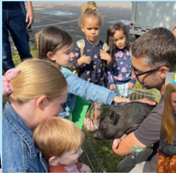
Our Preschoolers enjoyed a Petting Zoo