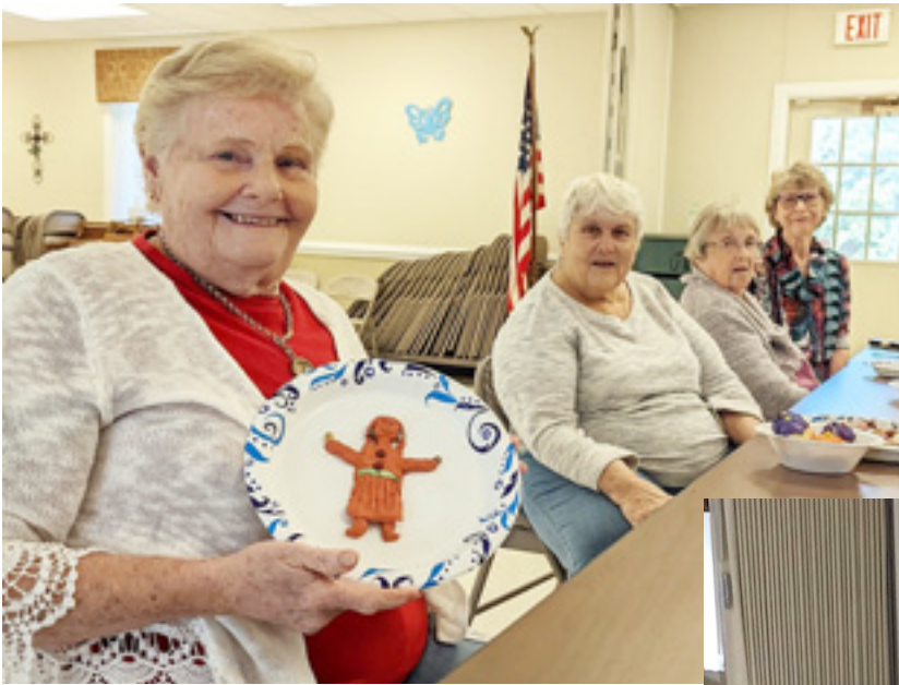
The United Women In Faith did a study on Jeremiah and the potter and the clay.