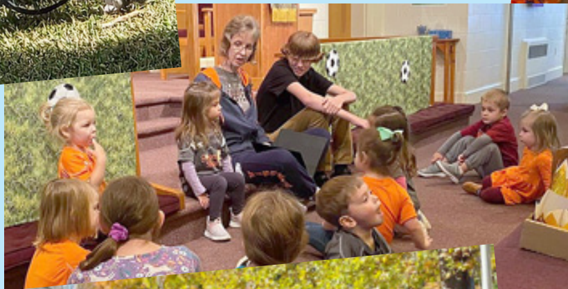
Every second Sunday is now "Children's Sunday" with casual dress and activities for the kids. Our first "Children's Sunday" kicked off with the theme "FIT FOR THE KINGDOM," and the kids ran the good race of faith down the center aisle!