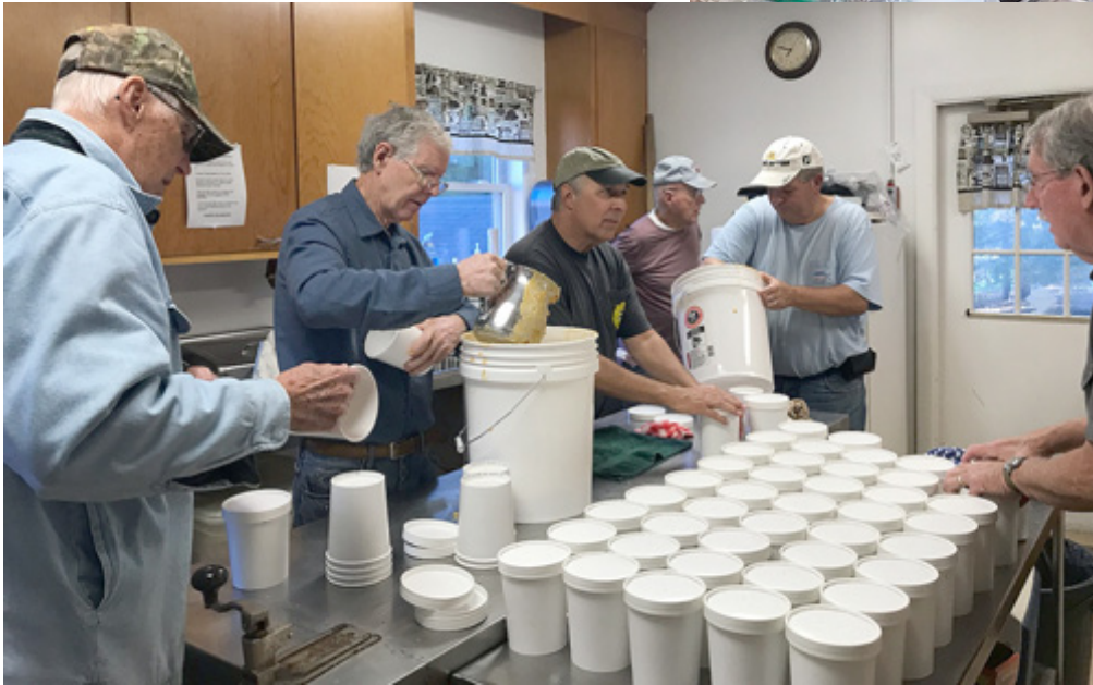
The United Methodist Men finish packaging their good Brunswick Stew.