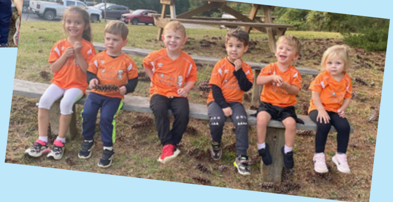
Soccer Shots 2-3 year olds had a fun year and learned a lot!