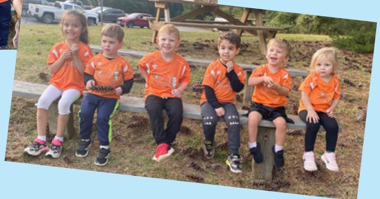
Soccer Shots 2-3 year olds had a fun year and learned a lot!