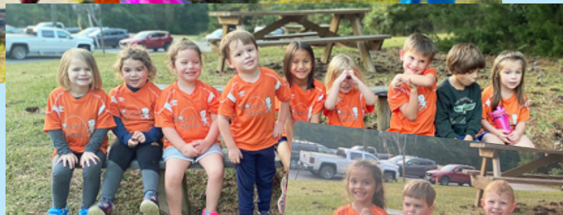
Congratulations to our Soccer Shots team .4-6 year olds have finished their fall season and are looking forward to next season!