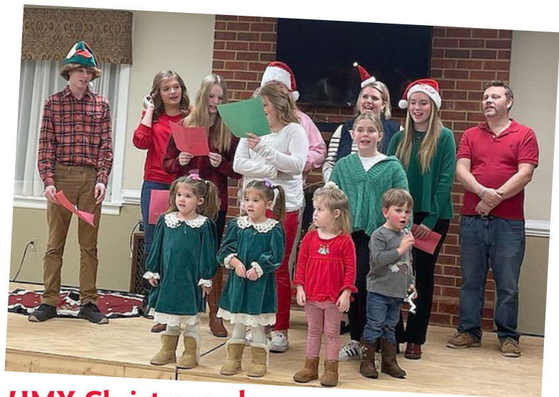
UMY Christmas play