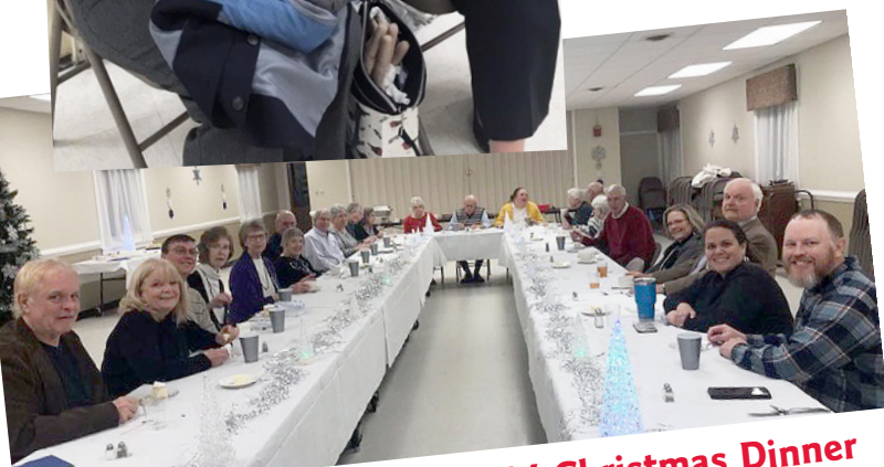
UMM Christmas Dinner