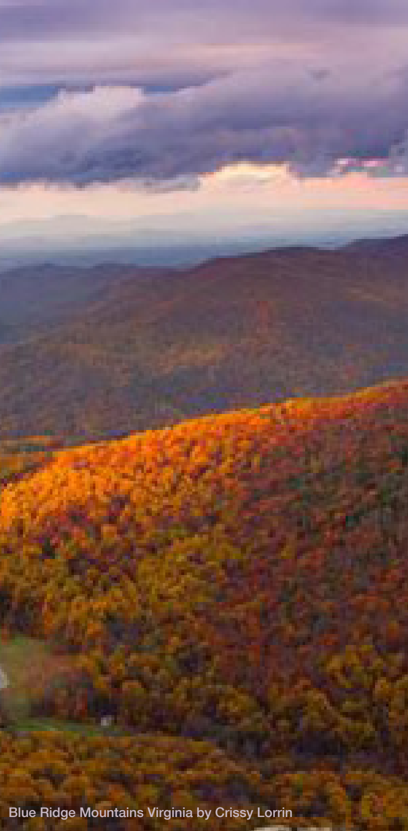
Blue Ridge Mountains Virginia by Crissy Lorrin