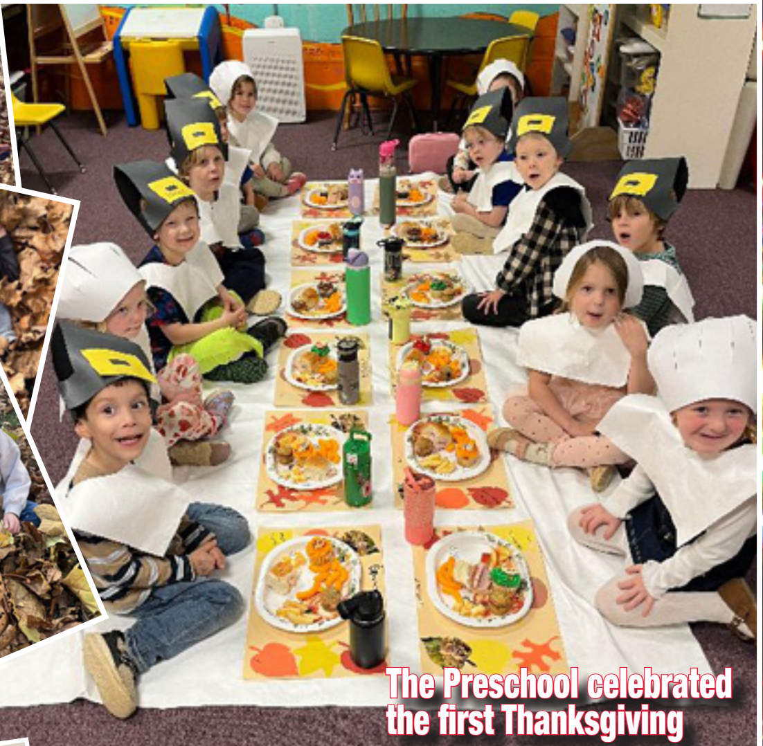
The Preschool celebrated the first Thanksgiving