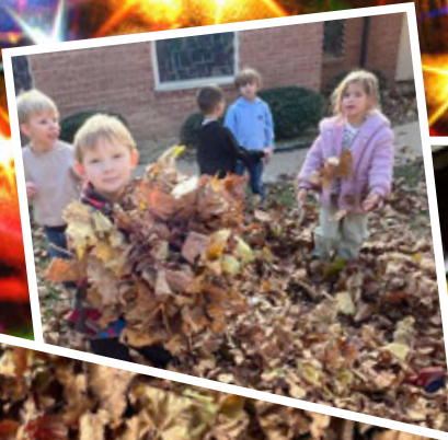
Raking Leaves sure is hard work