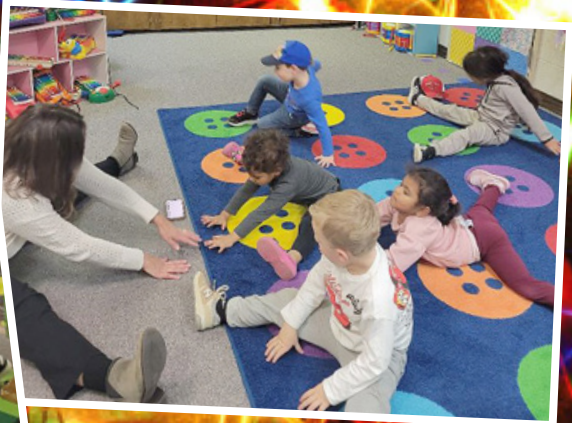
Our Evening Bible School Program is a BIG Success